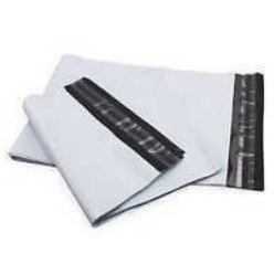
Plastic Shipping Envelope