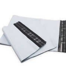
Mailing Packaging Envelope