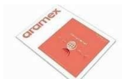
Tamper Evident Courier Bags