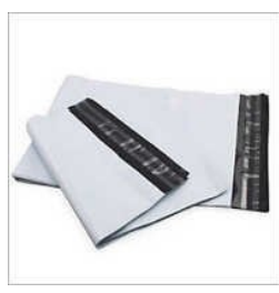
Custom Courier Bags