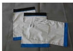
Plastic Mailer Envelopes