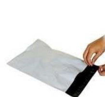
Plastic Courier Flyers