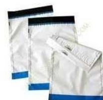
Plastic Courier Envelope