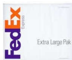
Tamper Evident Security Envelopes