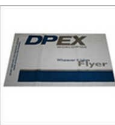
Tamperproof Courier Bags