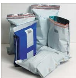
Shipping Courier Bags