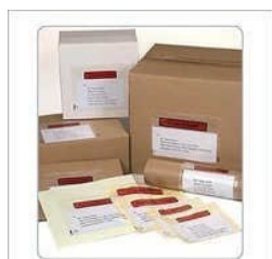
Packing List Envelopes