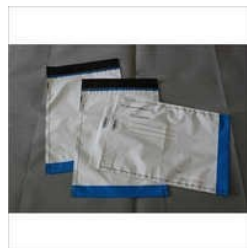
PACKAGING COURIER BAGS