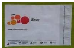
Printed Courier Bags