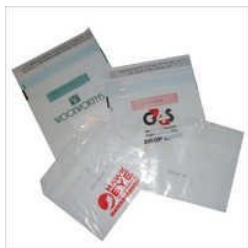
SECURITY COURIER BAGS

Adult Diaper Bags, Adult Diaper Packaging Bag, Adult Diaper Packaging Material, Advertising Bags, Advertising bags, BOPP Packaging Bags, Baby Diaper Bags, Baby Diaper Packaging Bag, Baby Diaper Packaging Material, Bakery Packaging Material, Bakery Pouching, Biscuit Packaging, Bopp Printed Baniyan Bags, Bread Bags, Bread Packaging Bags, etc.