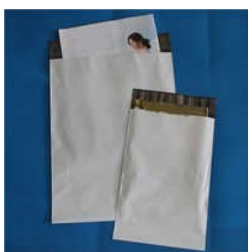
Plain Courier Bags