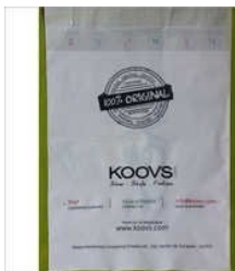
Color Printed Courier Bags