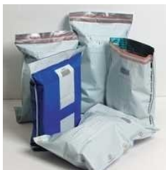
Custom Packaging Envelope